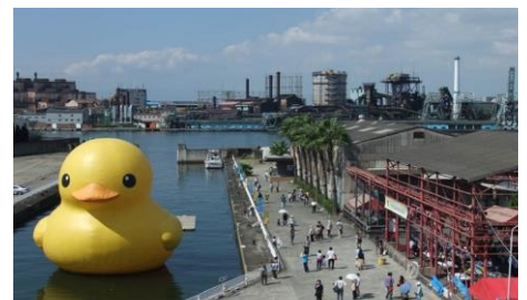
From left: Osaka Conference 2015 (organized by the Association), Art Mix Japan (Niigata), and Old Shipyard into a creative hub by Chishima Estate