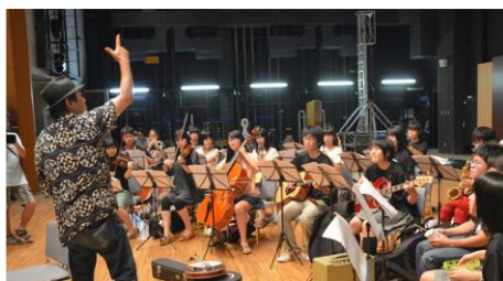
Project Fukushima (Fukushima Prefecture)