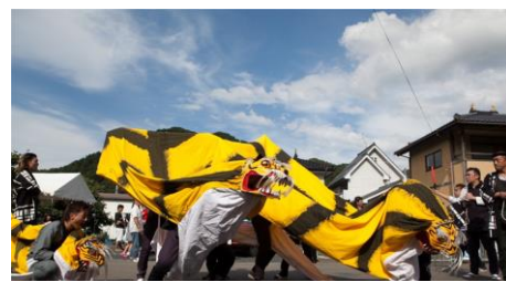
Otsuchi-Mukaigawara Toramai Restoration Project (Iwate Prefecture)