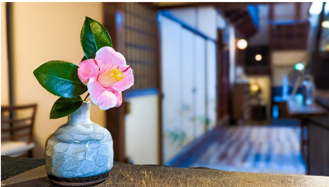
A casual single flower in a vase arranged by the staff. This attention to detail conveys their love for the building, which has in turn led to its careful maintenance and comfort

It is said that arts and culture help create local communities and contribute to economic development. However, corporate support of arts and culture does not immediately translate into operating profit numbers.