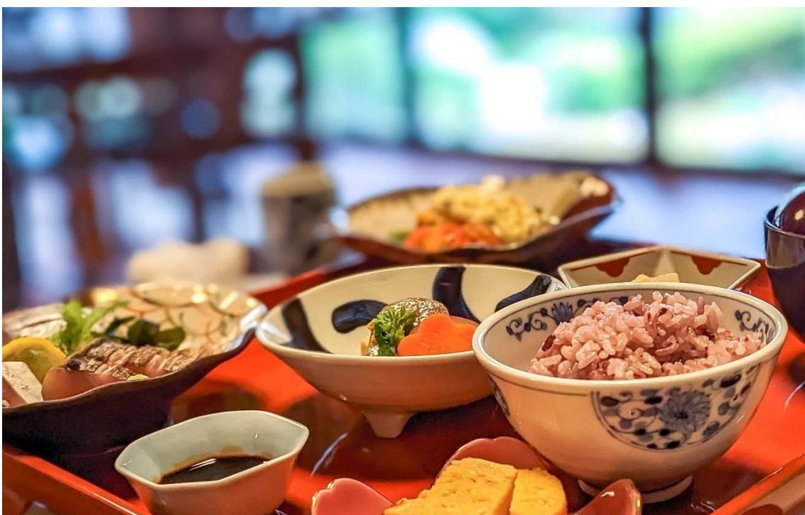
Lunch served at Kozainomori, Machiya Gozen. A healthy dish cooked with ingredients from Itoshima, such as Nijo red rice and black rice. Reservation required in advance

Even though receiving the Mécénat Award helped spread awareness of the importance of utilizing Kozainomori, it was still difficult for employees to visit the location spontaneously. Yuki Engineering's Head Office is located in Dazaifu City, and it takes about 50 minutes by car or about 2 hours by public transportation to reach Kozainomori. It was too far away to “drop by for a visit”.