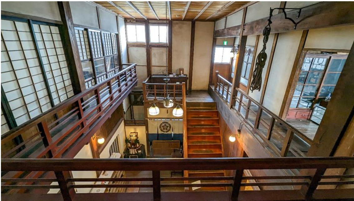
A view of the corridor from the Japanese-style room in Kozainomori. The construction technique and wood used for this building are now lost, so it will be impossible to reproduce the building once it is destroyed

The very existence of Kozainomori teaches us that everything that has been accumulated by people who lived in the past will eventually be lost if we do not actively maintain them.