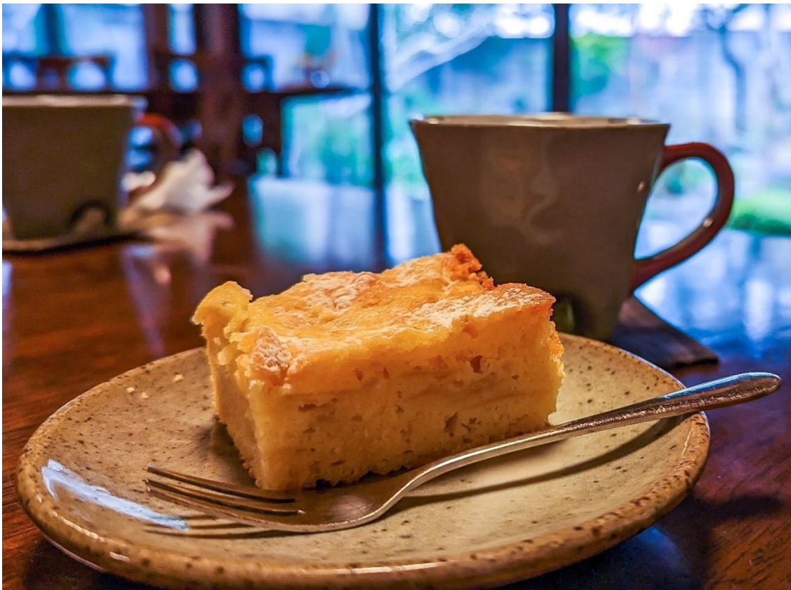
Homemade cakes made at Kozainomori Patisserie. Available for takeout and mail orders

While serving a healthy menu using locally sourced ingredients from Itoshima at Kozainomori, Yuki Engineering began to look into the production of safe food. Therefore, in 2021, the company opened Aso Kura Farm as an affiliate company. The company is currently working to achieve efficient and sustainable agriculture by utilizing their expertise in construction machinery.