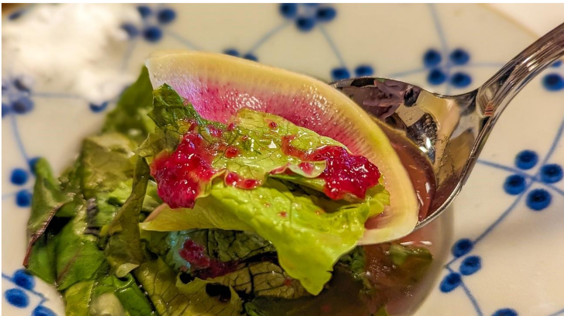
Soup made with vegetables harvested at Aso Kura Farm

How can the company utilize seasonal vegetables produced using pesticide-free farming methods? Creating new cooking methods is also one of the roles played by Kozainomori.