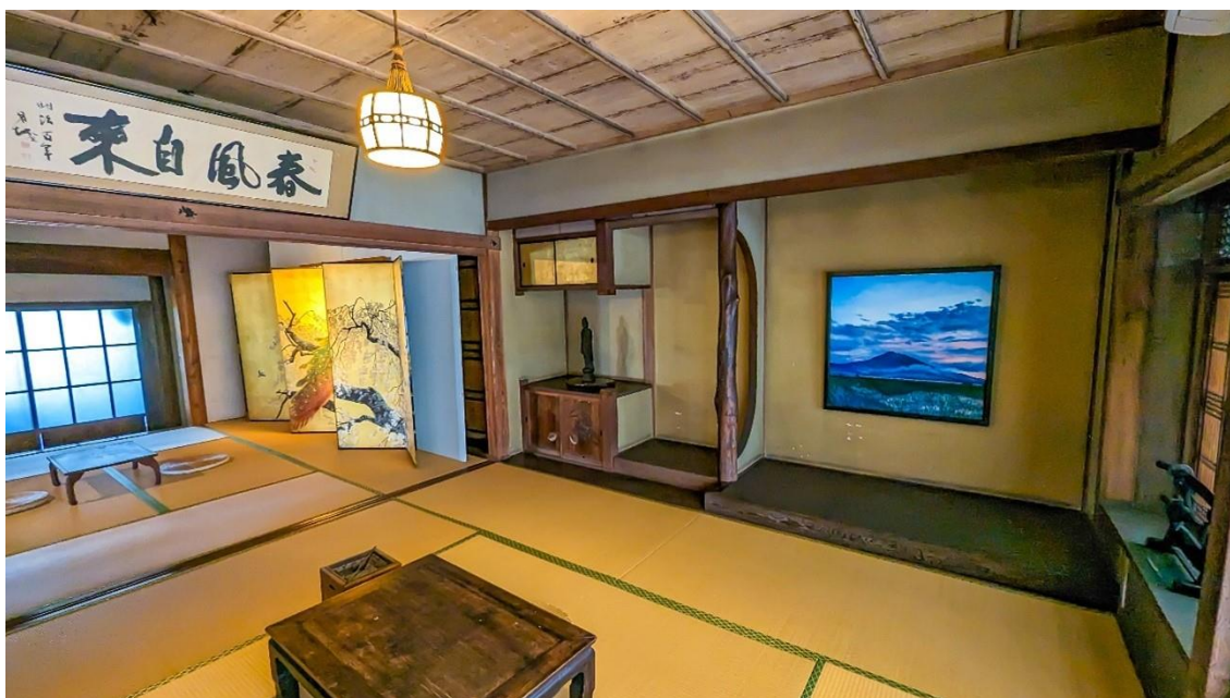
A tatami room with a traditional alcove on the second floor of Kozainomori. Also used as a tour and event space

Next, the company started holding employee trainings at Kozainomori. New employees of Yuki Engineering work as staff members at the facility for about a week, and receive on-site training on customer-oriented etiquette. No matter what kind of work they do, what lies before them is the customer as an individual. The skills they learn on how to interact with customers while working at Kozainomori will be useful to them in future, both within and outside the company.